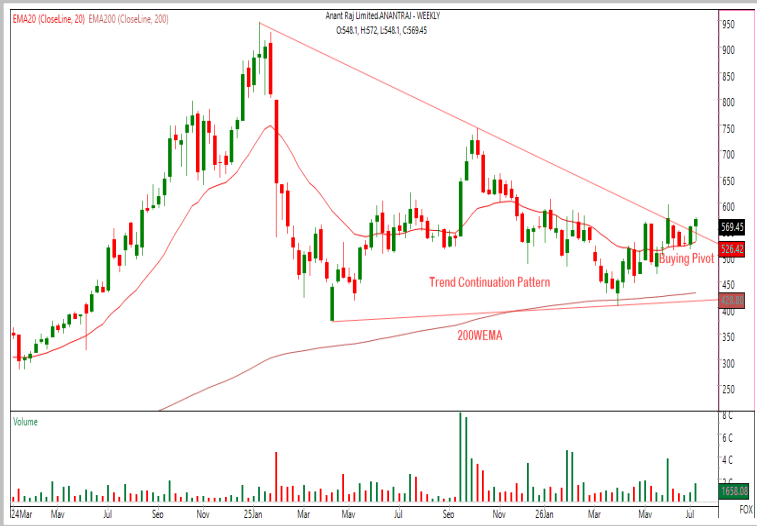
Technical Chart : Weekly